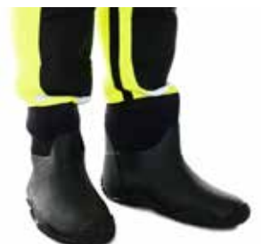
Soft rubber/neoprene boots allows use of flippers