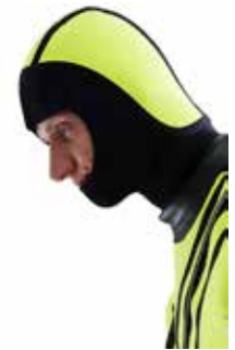
Separate neoprene hood with good closure