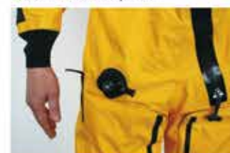
SI-TECH Inflation valve on lower body (optional)