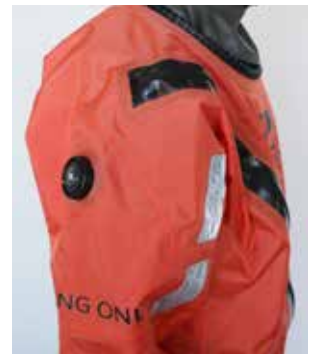
Low profile automatic exhaust valves on shoulders