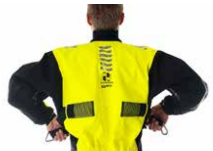
Lifting strap with D-ring and carabineer hook.