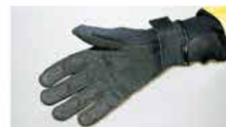
Reinforced 5-finger gloves in neoprene