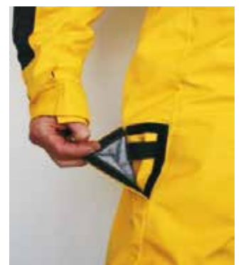
Knife pocket (on opposite side: light pocket for LED Lenser)