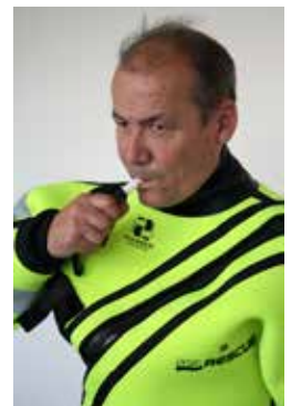
Inflation valve for extra buoyancy and insulation