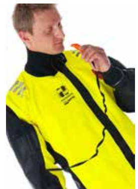
Whistle in sleeve pocket