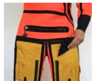
Roomy pockets on legs for storage