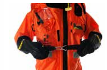
Lifting strap with stainless steel D-ring and carabine hook