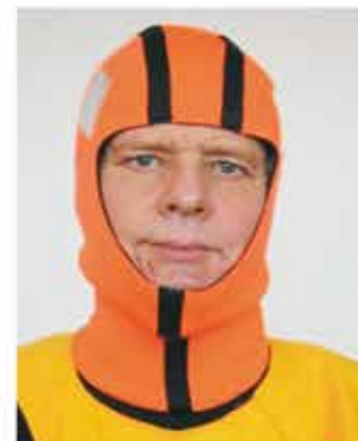
Hood in hi-vis neoprene