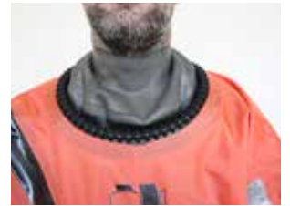
Easily exchangeable cuffs and neck seal