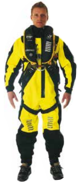
Compatible with SeaLion lifejacket