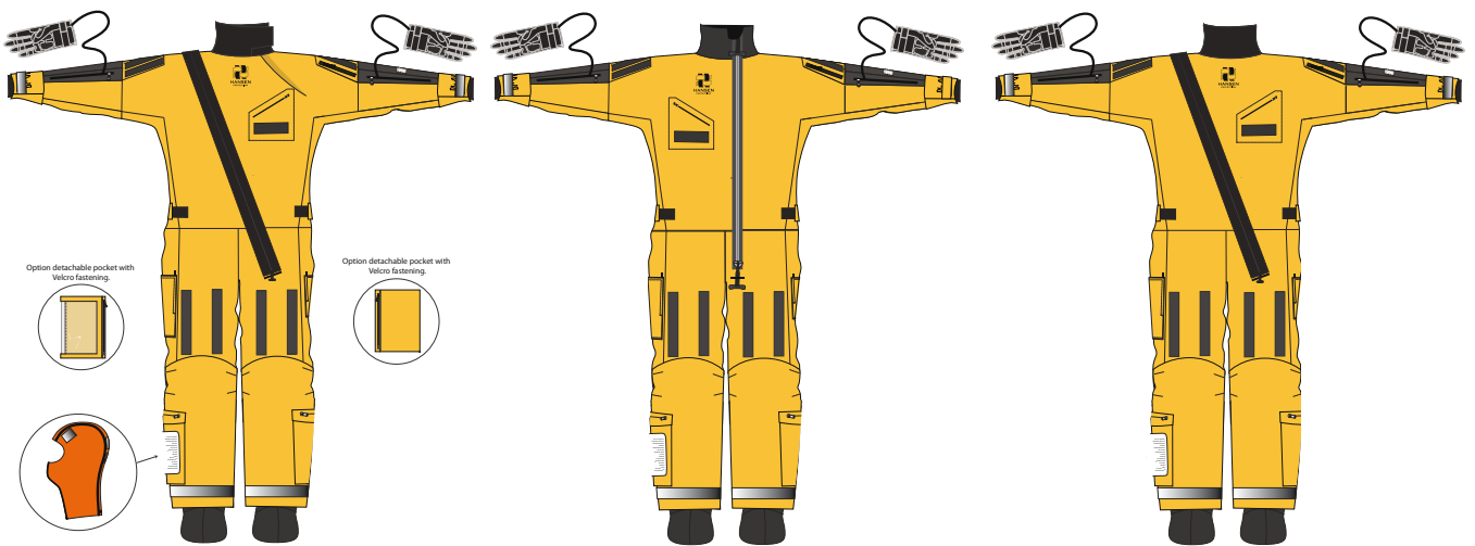
Adjustable neck seal

As an alternative to the suit with waterproof zip in neck seal, Hansen Protection offers a suit with a innovative neck seal construction and separate waterproof zipper