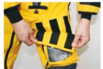
Roomy detachable thigh pockets with room for map/notebook/iPad Mini