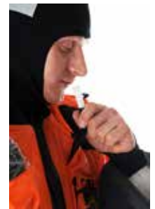
Manually inflatable lung for comfort and freeboard