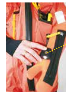
Orientation light on glove