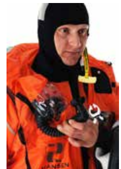
HP'S unique emergency breathing system