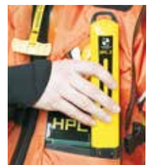
Fits only in HPL antenna pocket