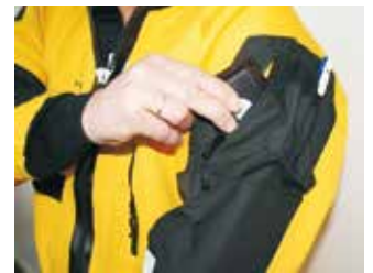
Roomy mobile & pen pocket