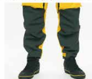
Reinforcement fabric on lower legs, pocket for kneepads inside knee.