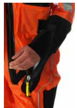
Integrated three finger glove with waterproof zip