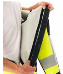
Heat reflecting lining laminate for insulation