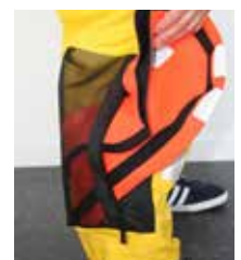
Orange neoprene hood in leg pocket