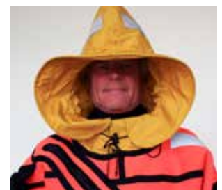
Hood allows use of helmet - semirigid cord allows optimal adjustment