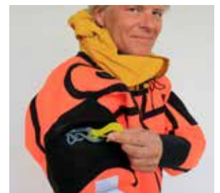
Buddyline with floating hook