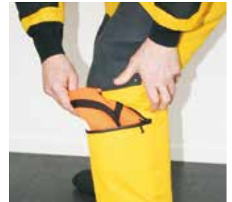
Hood (orange) in leg pocket