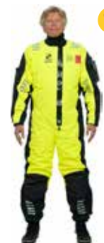
SeaAir Europe Training