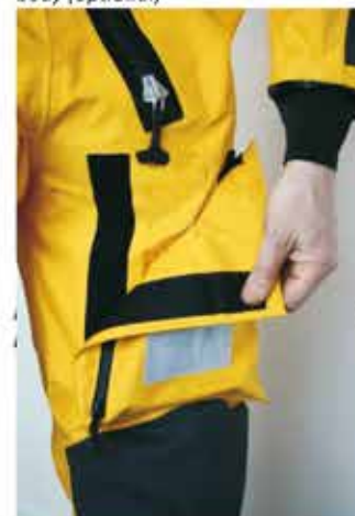
Roomy detachable thigh pockets with room for storage/extra weight (optional)