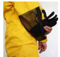
Gloves in sleeve pockets