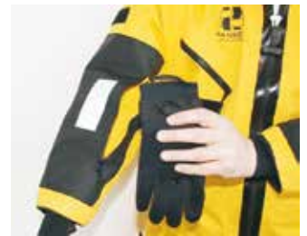
Sleeve pockets with gloves