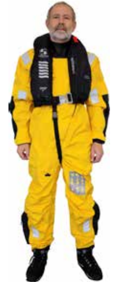
Approved to be used with SeaLion Europe lifejacket