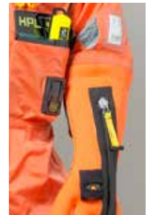
HPL-2 (PLB) with homing on 121,5 MHz and AIS-SART (MOB) for improved localisation