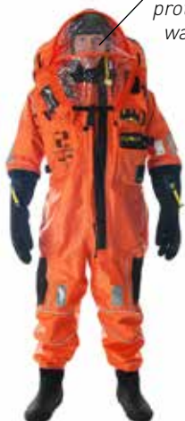
Sprayshield for protection against water and birds